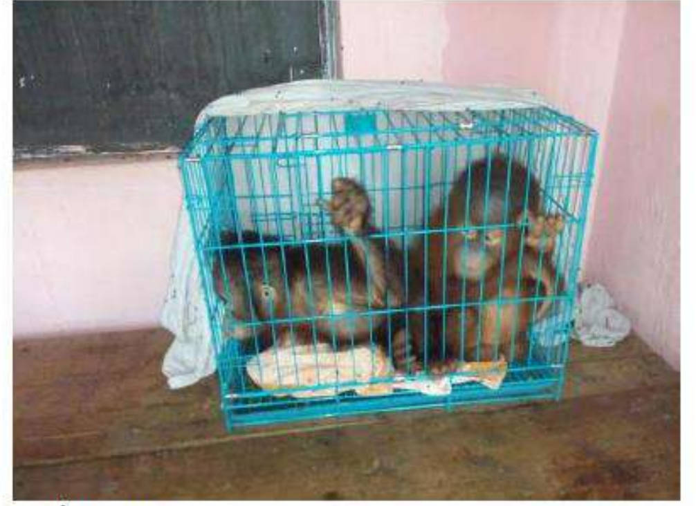
Special Arrangement The rescued orangutans.